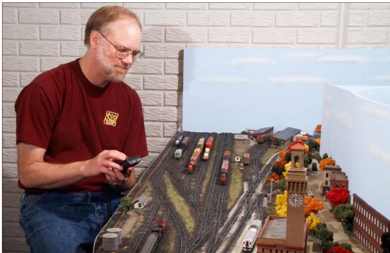
Controlling a train on a layout that you built gives you a great thrill. You get to set the speeds of the train and determine the scenery you want to put on your layout.